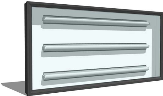
EXAMPLES OF 60"W X 32"H CASE